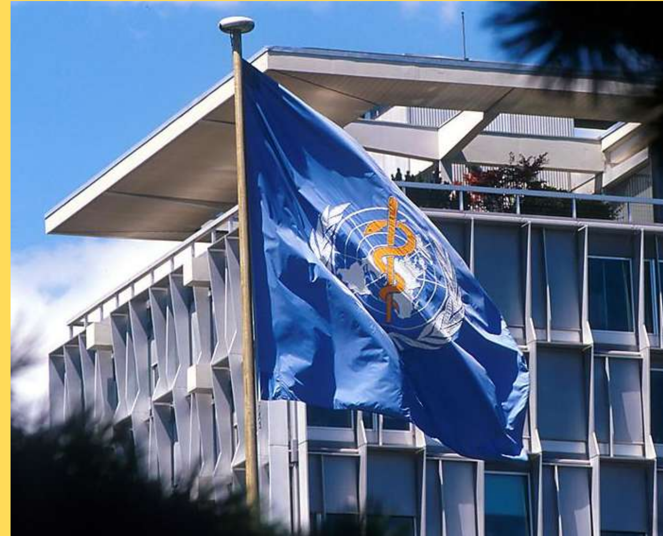
WORLD HEALTH ORGANIZATION

World Health Organization ( WHO ) is a specialized agency of the United Nations concerned with International Public Health. Its primary role is to direct and coordinate international health within the United Nations system. Its main areas of work are health systems , health through the life-course, non communicable and communicable diseases, preparedness, surveillance and response, and corporate services.