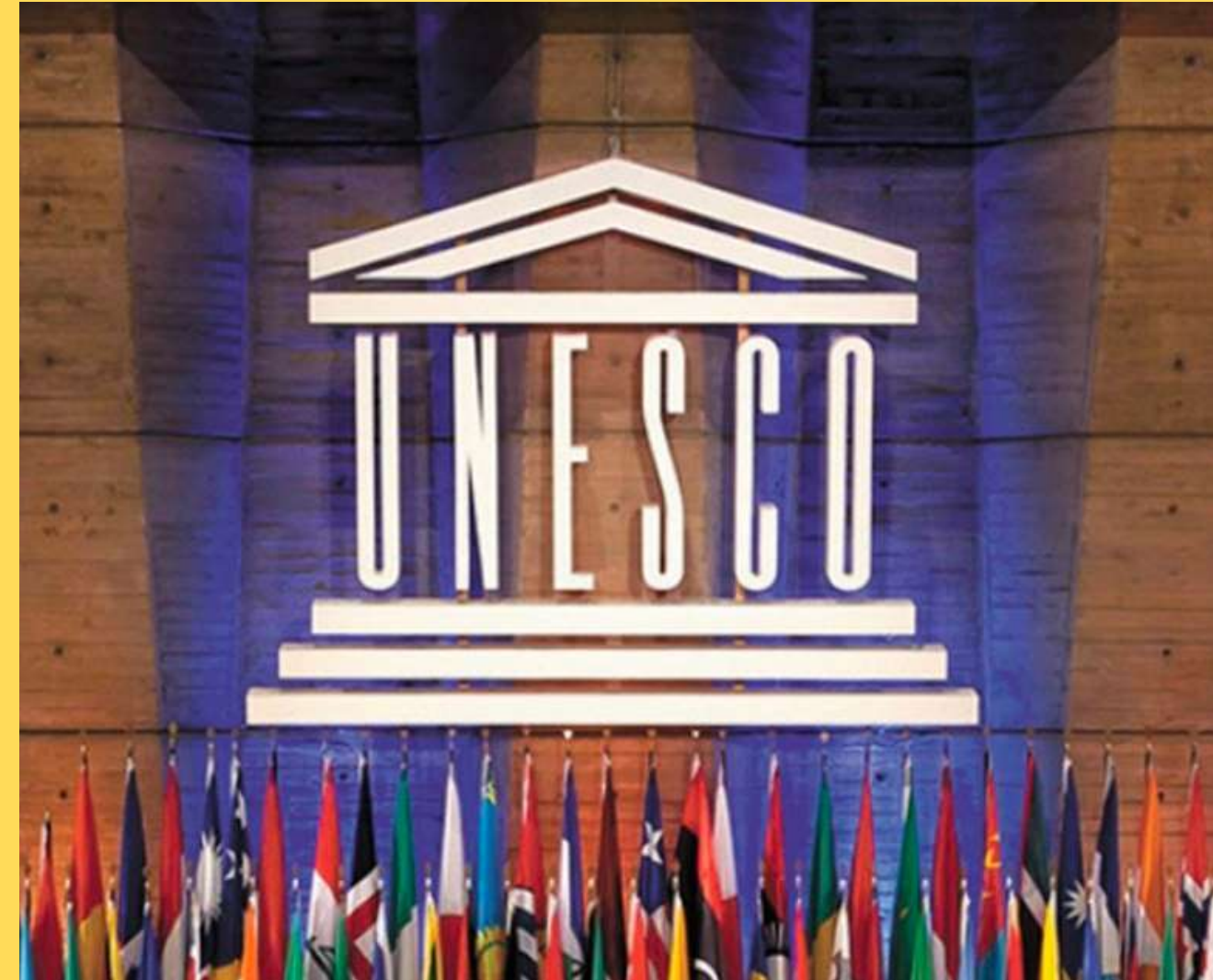
UNITED NATIONS EDUCATIONAL SCIENTIFIC AND CULTURAL ORGANIZATION

UNESCO or United Nations Educational Scientific and Cultural Organization, specialized agency of the United Nations that was chartered in a constitution, was signed on November 16, 1945 . The constitution, which entered into force in 1946 , has the main tenacity to promote international collaboration in the field of Education, Science and Culture. The organization's headquarters are in Paris, France. UNESCO has 195 member states and ten associate members. Most of its field offices are ' cluster ' offices, covering three or more countries; national and regional offices also exist. UNESCO's activities have been primarily facilitative, intended at assisting, supporting, and supplementing the national efforts of member states to eradicate illiteracy and to expand the access of education.