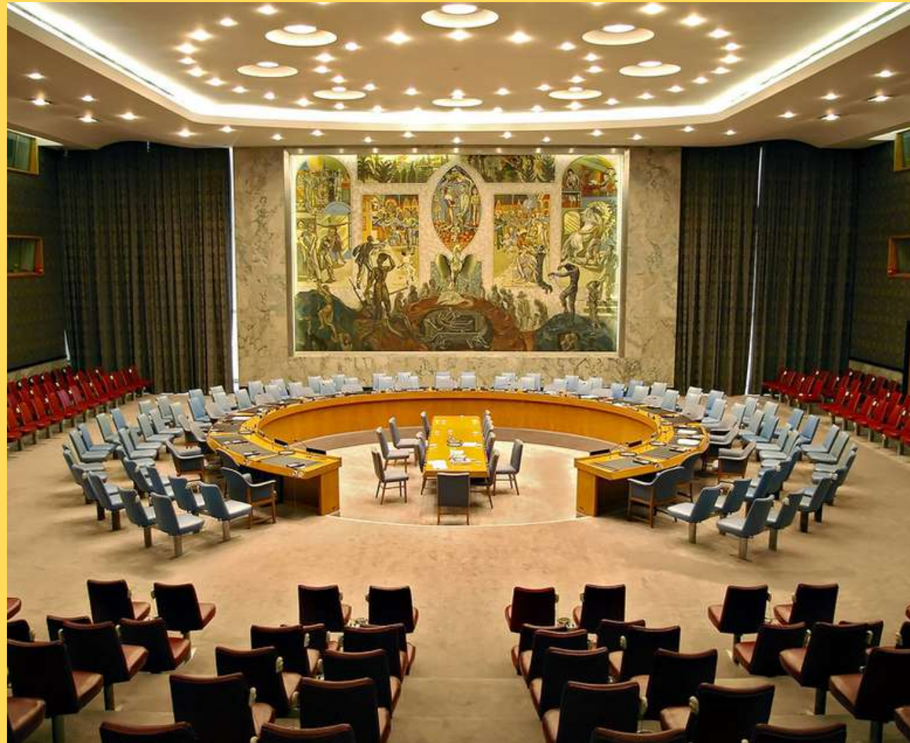
UNITED NATIONS SECURITY COUNCIL