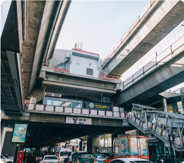
BTS Skytrain: Siam Station