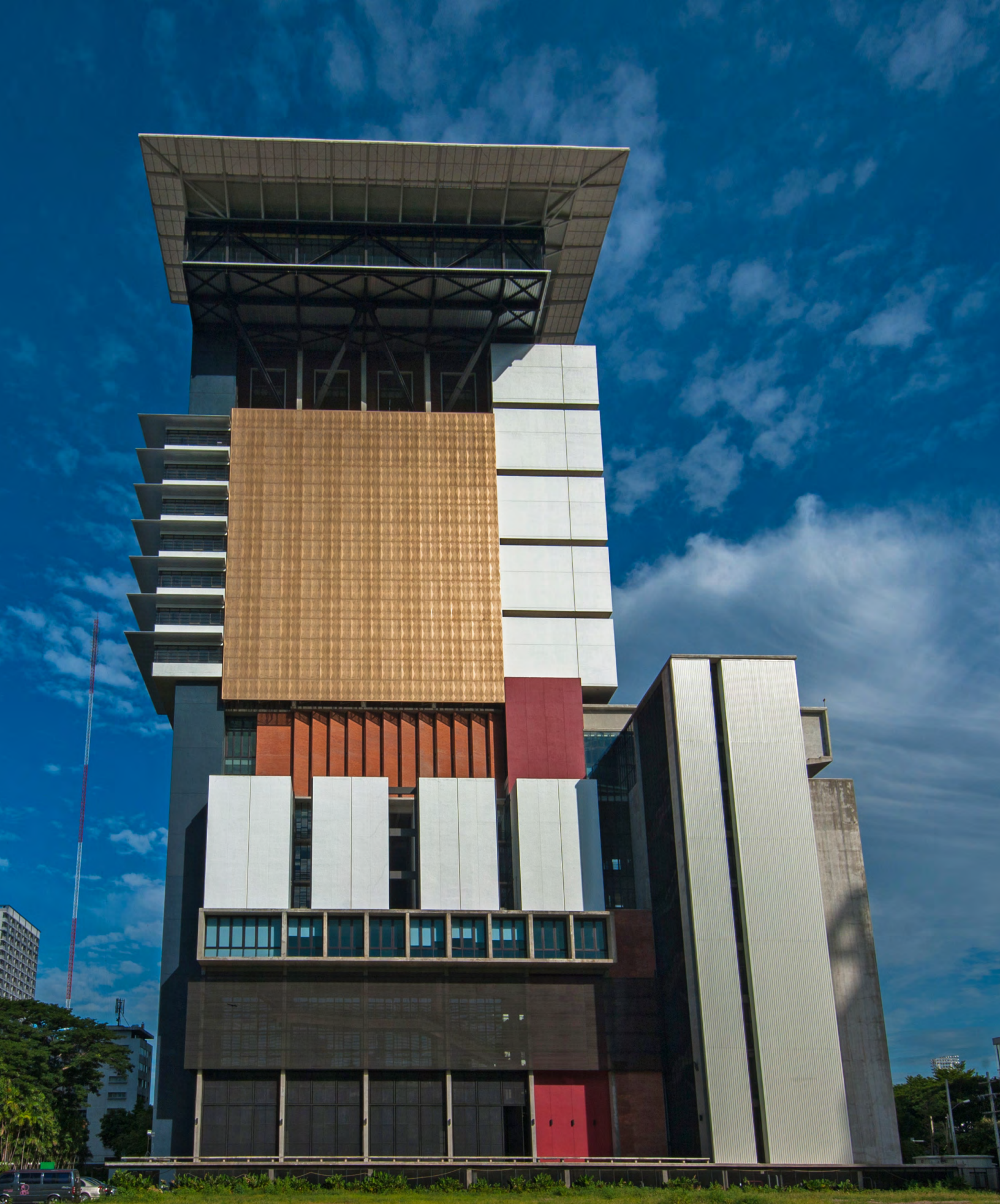
CHALOEM RAJAKUMARI 60 BUILDING (CHAMCHURI 10 BUILDING)