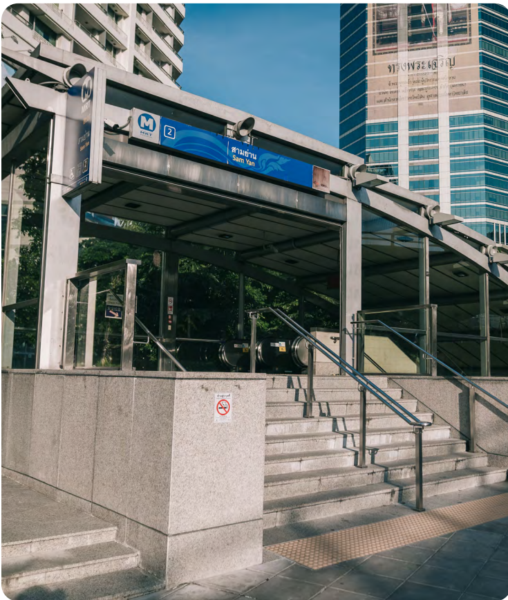
MRT: SAM YAN Station

Tuk-Tuk is a worldwide recognized symbol of Thailand with its distinctive design and sound. Tuk-Tuk is a small vehicle with three wheels, that can seat two or three passengers. One should negotiate the price before taking a Tuk-Tuk. Fares vary, depending on the distance, the time of the day, and the traffic. The trick for foreigners that they should not accept the first offer and try to reach a fair bargain.