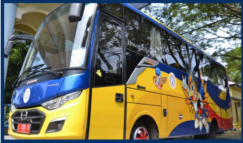
1-2 units of UNAIR Flash Bus

There will be at least 2 buddies per day per bus (assisting in picking up the participants from hotel to campus, site visits, field trip, and else)